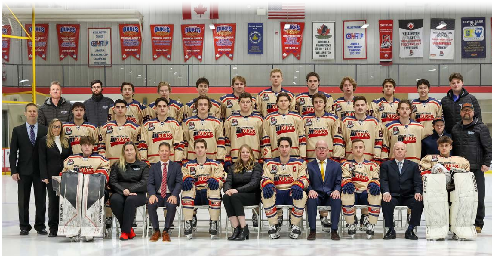
2023/2024 WELLINGTON DUKES