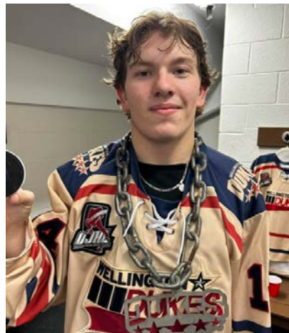
October 29th first OJHL Goal